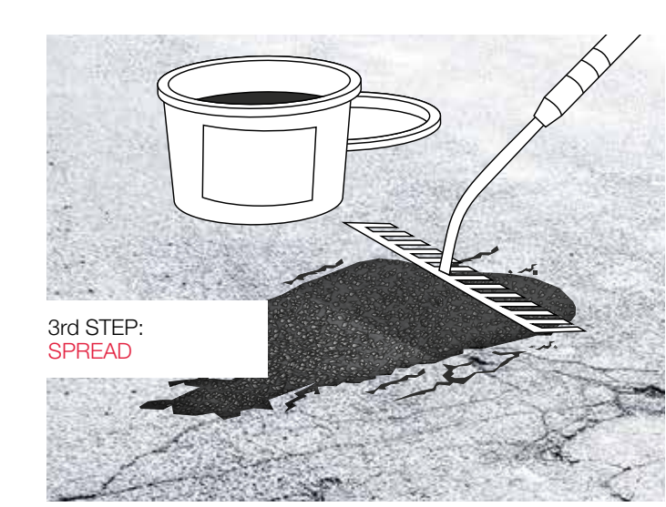
Spread the required amount of EASYPHALT® slightly protruding the height of the original surface.