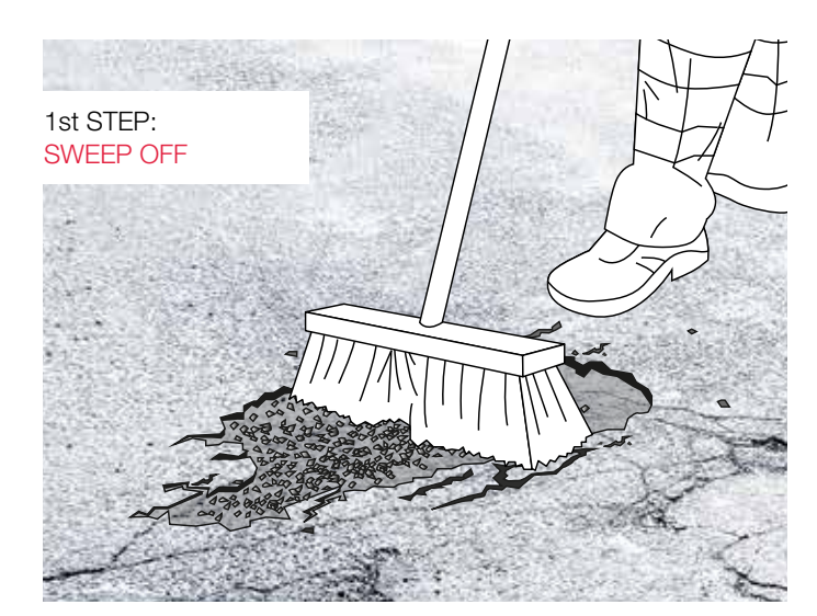
Before installation remove any dirt from the surface.

Get the success you want with little effort: