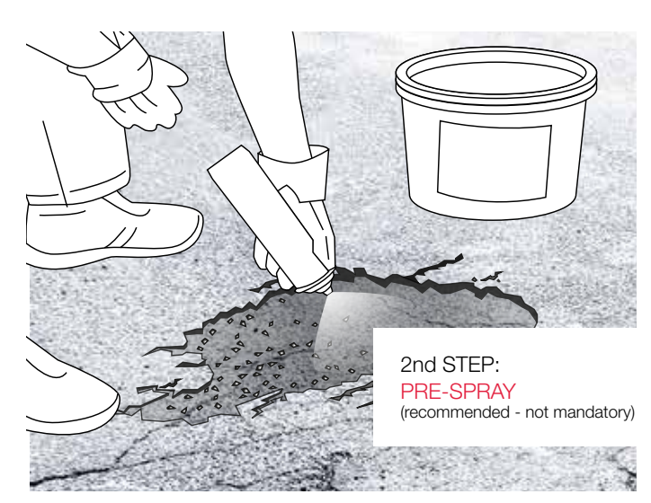
RECOMMENDATION: For maximum durability, we advise that you treat the installation surface with a bituminous primer like EASYPHALT® PRIME .